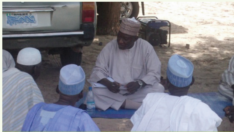
An enumerator discusses a survey of civil servants with local government officials